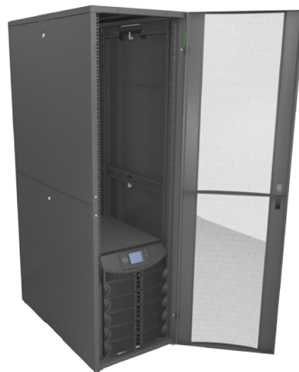
The Liebert APS UPS can be installed on raised floors, traditional flooring, or in rack enclosures.

ENERGY STAR® qualified UPS models – UPS products meeting the EPA's requirements use an average of 35% less energy than their standard counterparts.